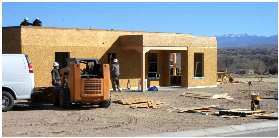
A home under construction in Pueblo de San Ildefonso

Additionally, the pledge and guarantee eliminate the need to