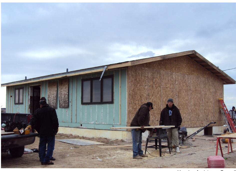
Housing Assistance Council

Articles by non-OCC authors represent their own views and not necessarily the views of the OCC.