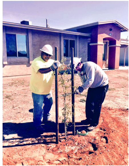
Bank of America

In 2011, the San Felipe Pueblo Housing Authority (SFPHA), a tribal entity of the pueblo, applied for housing rehabilitation under the Indian Community Development Block Grant Program (ICDBG) and the Indian Housing Block Grant (IHBG) Program, both administered by the U.S. Department of Housing and Urban Development (HUD).<sup>3</sup> To be approved for funding, a tribal entity must undergo an extensive