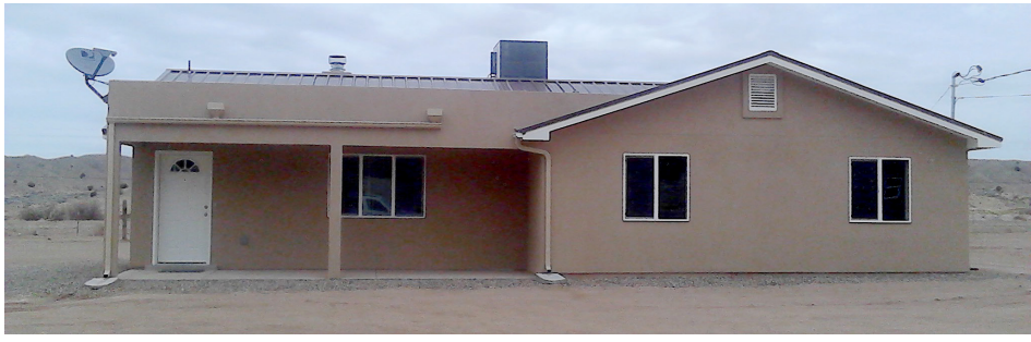
Bank of America

The Tohono O'odham Nation is a federally recognized tribe in southwestern Arizona. With 28,000 members and a land base approximately the size of Connecticut, the Tohono O'odham Nation is the country's second-