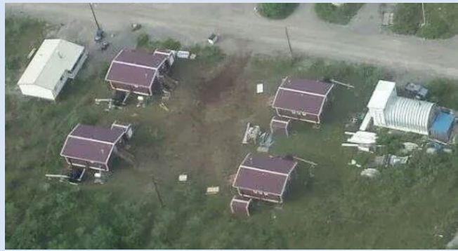
Office of Loan Guarantee, U.S. Department of Housing and Urban Development Homes in one of the Villages of Anaktuvuk Pass

The Tagiugmiullu Nunamiullu Housing Authority in Alaska used a $6,752,160 Title VI program loan from Wells Fargo to build 24 homeowner units in six villages. The units used high energy-efficient technology that significantly reduced energy costs and improved affordability in an extreme climate in northern Alaska. The Title VI guarantee was secured by pledges from six tribes in Alaska.