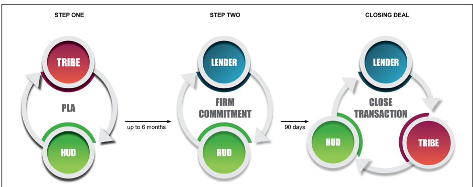
Figure 1: Title VI Application and Loan Guarantee Process