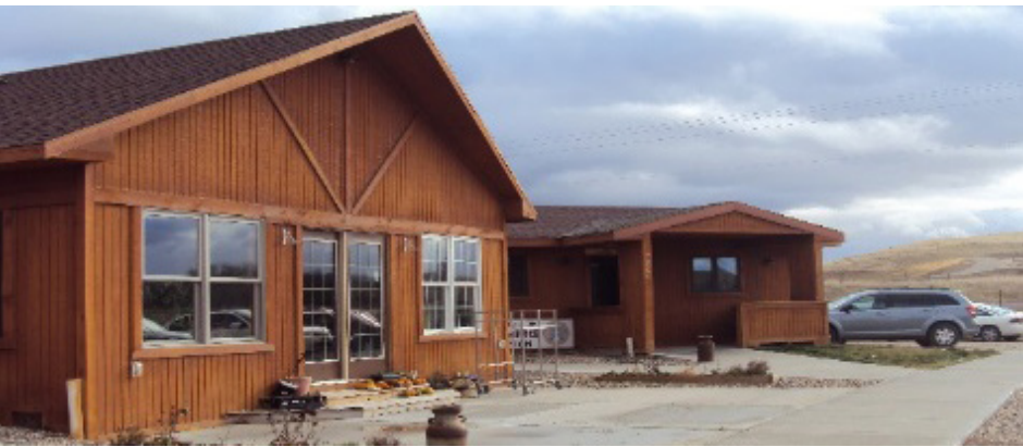
Housing Assistance Council

The Oglala Sioux people struggle with chronic housing issues. The tribe's official waiting list for houses has over 500 applicants, and most members have become discouraged and choose not to apply for tribal housing. The instability caused by the shortage of quality housing often results in overcrowded housing and