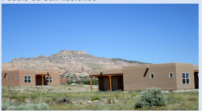
Office of Loan Guarantee, U.S. Department of Housing and Urban Development A home in Pueblo de San Ildefonso

The Northern Pueblos Housing Authority in New Mexico built 10 units of lease-purchase housing in the Pueblo de San Ildefonso. The $2 million project used a $645,000 loan from the Rural Community Assistance Corporation guaranteed by the Title VI program.