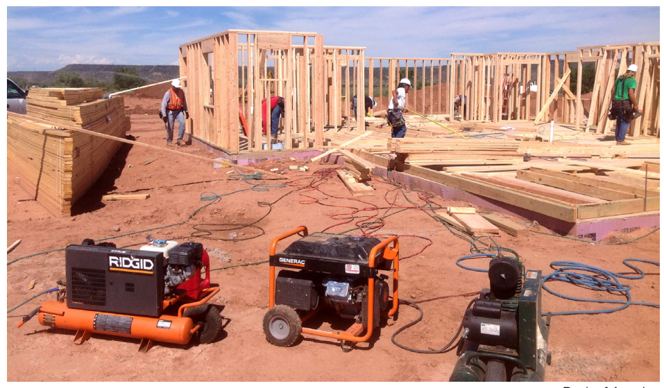
Bank of America

In 2009, Bank of America renewed this commitment with a 10-year, $1.5 trillion community development goal of lending and investing in LMI communities, including $50 billion dedicated to help build up rural and Native American communities. From January 2009 through December 2015, approximately $797 billion has been funded as part of the community development goal, including $35 billion supporting rural and Native American programs. Leveraging its expertise