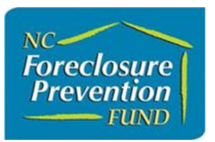
The North Carolina Housing Finance Agency uses a targeted approach to efficiently identify eligible homeowners who may wish to participate in the state's Hardest Hit Fund program.

One of the challenges Hardest Hit Fund (HHF) administrators grapple with is how to efficiently identify eligible homeowners who may wish to participate in their state program. Most administrators use mass media advertising to raise awareness among the general public and encourage distressed borrowers to call their state's HHF hot line. Some states also have developed Web sites capable of screening eligible borrowers' applications. The North Carolina Housing Finance Agency (NCHFA), meanwhile, has taken a more targeted approach. While the agency recently invested in significant television and digital advertising—and hosted on-air TV phone banks across the state—its emphasis from the start has been direct outreach to homeowners who are potentially eligible under the NCHFA's HHF program, the North Carolina Foreclosure Prevention Fund (NCFPF).