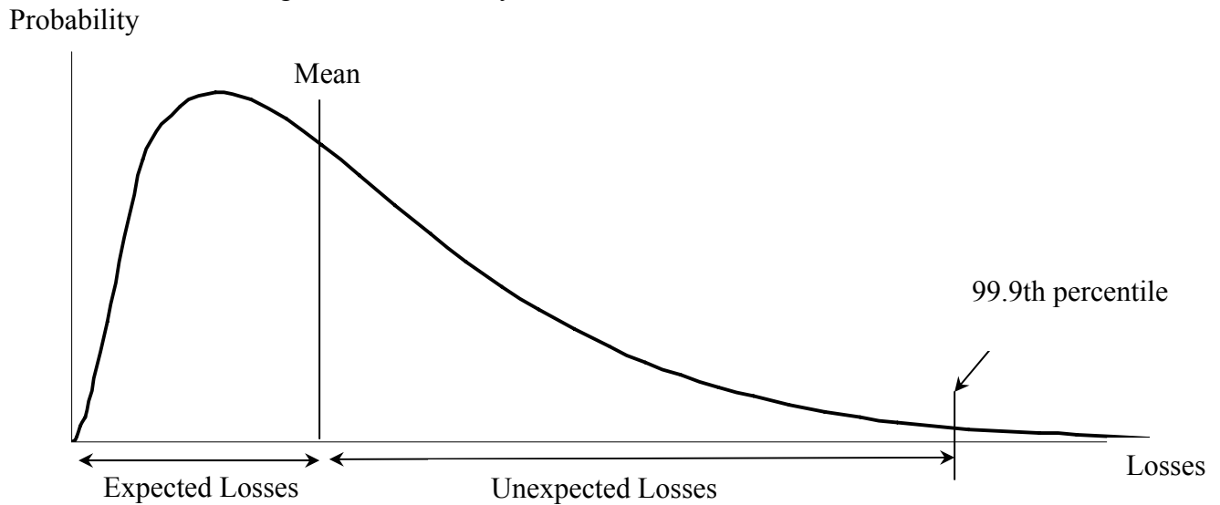
Figure 1 – Probability Distribution of Potential Losses

The area under the curve to the right of a particular loss amount is the probability of experiencing losses exceeding this amount within a given time horizon. The figure also shows the statistical mean of the loss distribution, which is equivalent to the amount of loss that is “expected” over the time horizon. The concept of “expected loss” (EL) is distinguished from that of “unexpected loss” (UL), which represents potential losses over and above the expected loss amount. A given level of unexpected loss can be defined by reference to a particular percentile threshold of the probability distribution. In the figure, for example, the 99.9 th percentile is shown. Unexpected losses, measured at the 99.9 th percentile level, are equal to the value of the loss distribution corresponding to the 99.9 th percentile, less the amount of expected losses. This is shown graphically at the bottom of the figure.